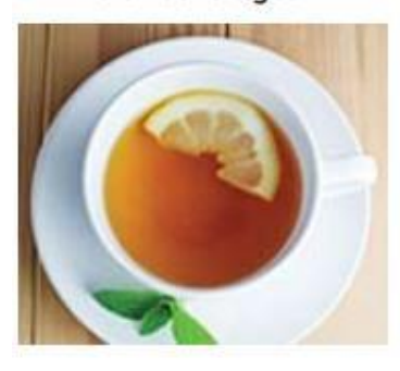
OK to eat: