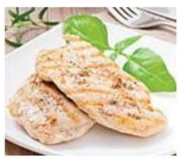
OK to eat: