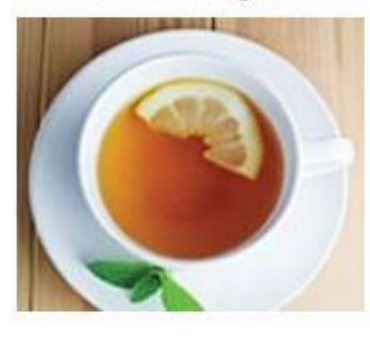
OK to eat: