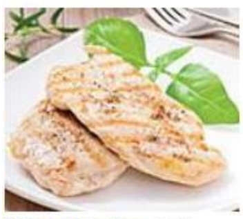
OK to eat: