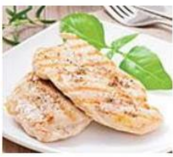
OK to eat: