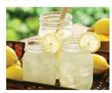
OK to eat: