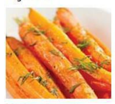
OK for some if cooked or canned: